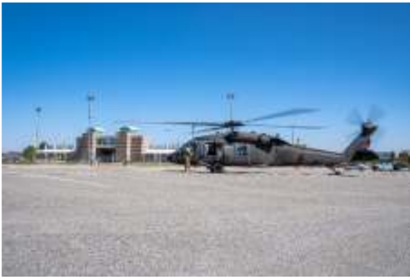
Thanks Huey Pilot and Crew (Bell UH-1 Iroquois)!