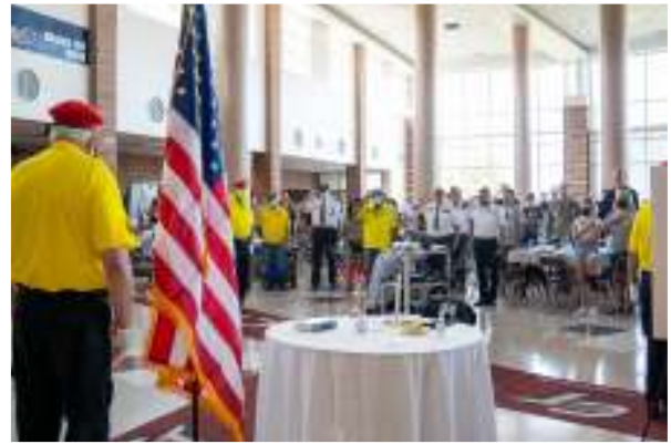
Missing Man Table Presentation