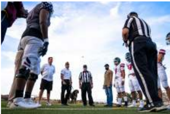
Pre-game coin toss!