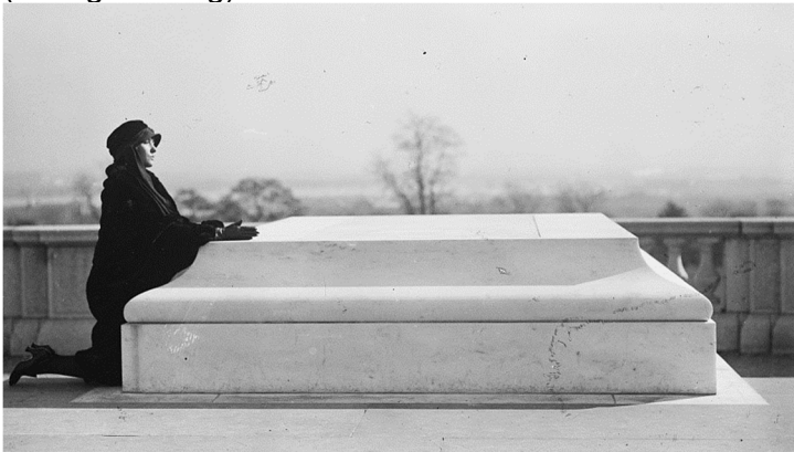
A woman mourns at the Tomb of the Unknown Soldier in 1922. Thousands of American families lost loved ones in World War I, many of whom remained missing or unidentified.

Society of the Honor Guard/Centennial (TUS100) (tombguard.org)