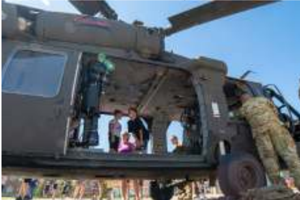
CCD School Kids having a ball checking things out!