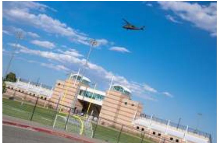
Huey – Departing! HoooYaa!!!