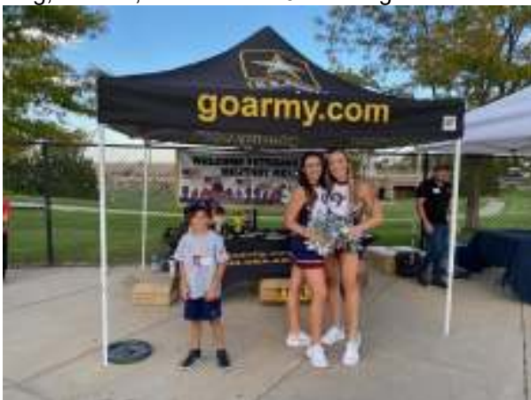
Go NAVY beat ARMY ((Editor: I had to say that!)