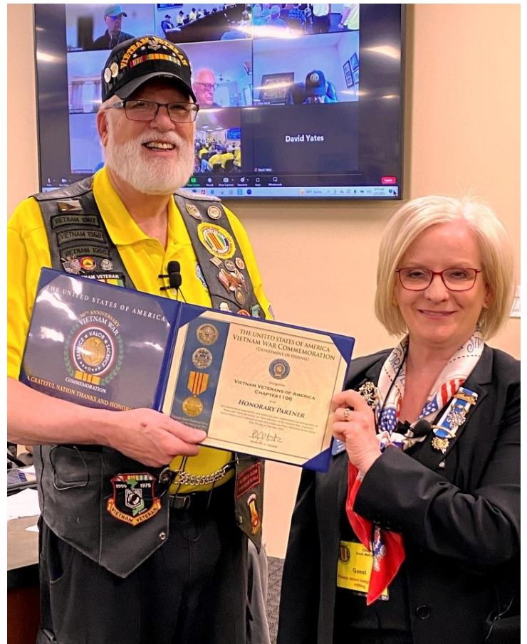
Presentation of the Commemoration Certificate