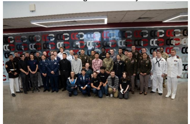
The entire ceremony group!