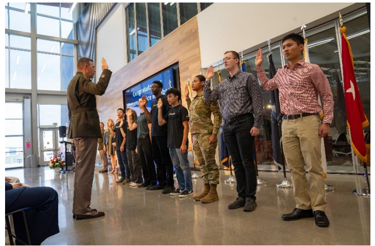
Swearing In Ceremony