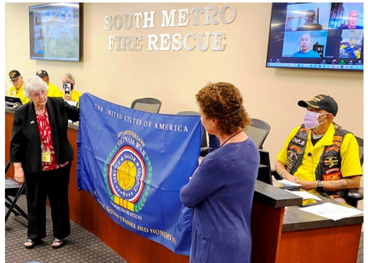
DAR representatives display the Commemoration flag presented to the Chapter