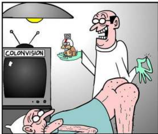
Do you want to go with the deluxe colonoscopy using a tiny fiber optics camera, or the economy procedure using the hamster and GoPro helmet?