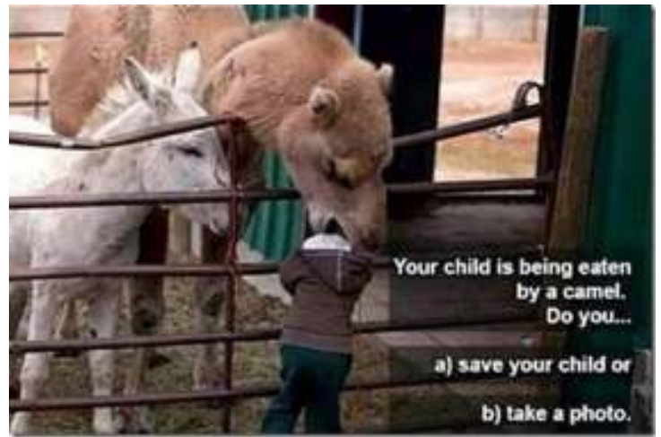
Gotta love those "smart" phones! (Editor)

You know, it hurts when hot coffee spurts out of your nose!