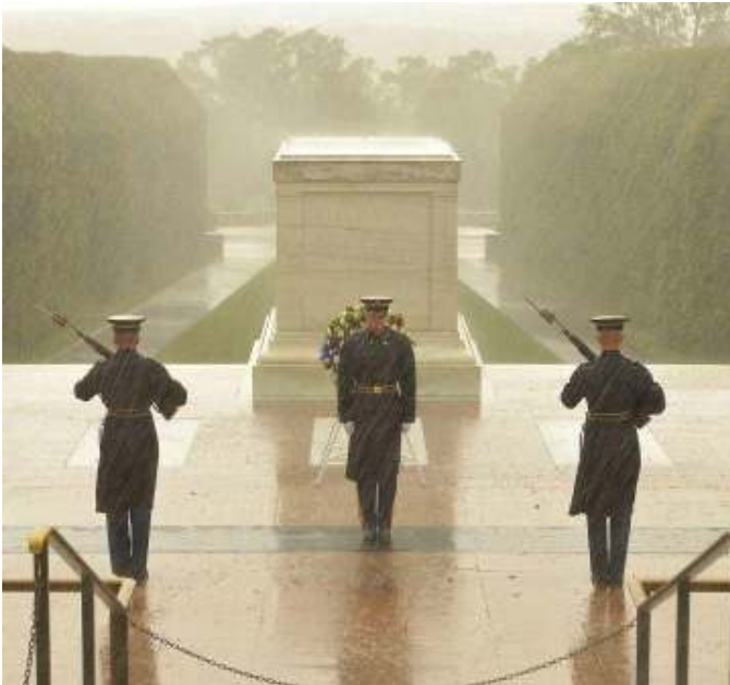
Never Alone under all conditions!

What is Pogey Bait ? See answer at the end of the Newsletter