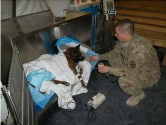
Helping hand to a faithful friend!