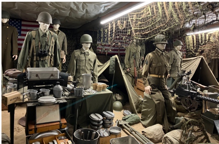
Chapter 1106 members visited Dragonman's Military Museum in Colorado Springs on June 18. See details and more photos from the museum visit on pages 15 and 16.

Chapter 1106 meets the first Saturday of each month at 9 a.m. at South Metro Fire and Rescue Building, 9195 E Mineral Avenue, Centennial CO 80112.