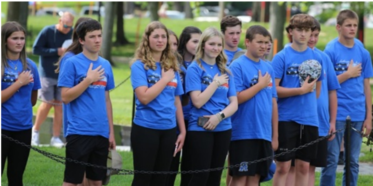
High school students pledge allegiance to the flag at the 50 th anniversary memorial event.