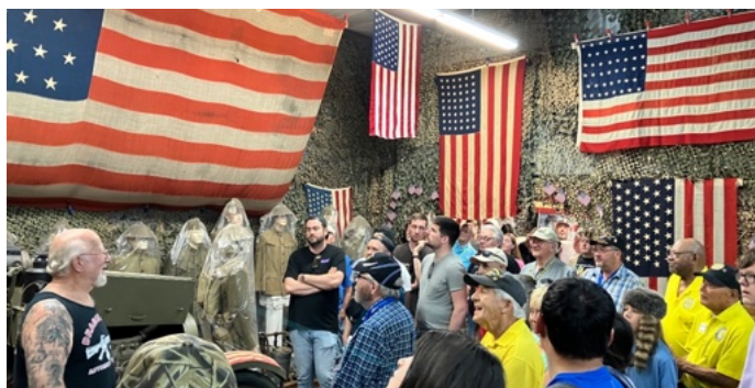
Above, a rare weaponized belt buckle worn by Nazi soldiers in WW II. At right, US flags from various eras.