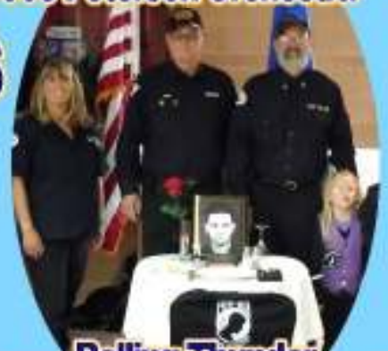
Rolling Thunder "Missing Man Ceremony"

"Englewood High School Military Memorial"