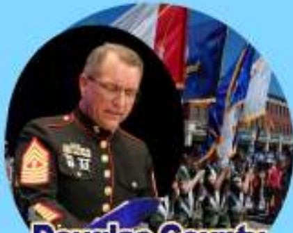
Douglas County Young Marines