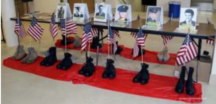
Honor table for former students of EHS

bugler, a rifle salute and present an American Flag to one of our Gold Star family members. See flyer at the bottom of the newsletter.