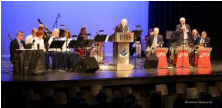
Stage for event!