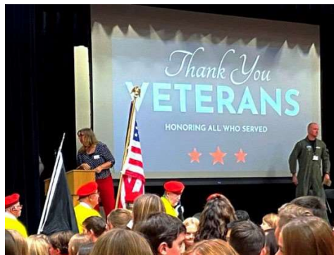
Ben Franklin Academy Veterans Day

Ben Franklin Academy once again honored veterans and active military at this year's Veterans Day celebration. The entire school mobilizes for this event, with students attending in two separate sessions. The Chapter's color guard presented the Colors at both sessions.