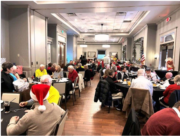
Great Attendance by Members and Spouses