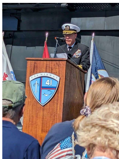
Guest Speaker Navy Commander