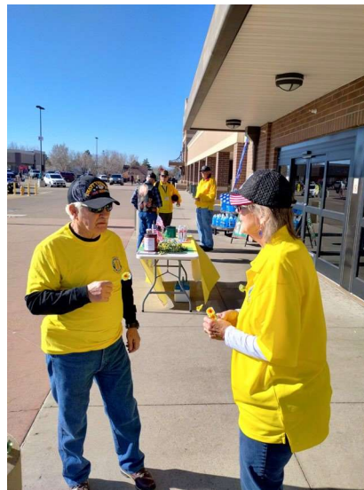
Chapter 1106 at King Soopers

Chapter 1106 members handed out Poppys to King Sooper customers at several locations on Veterans Day. Many customers responded in kind with donations to the Chapter. Thank you to members who came out to help.