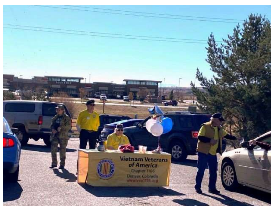
Chapter 1106 at Texas Roadhouse

Chapter 1106 members helped hand out free meal coupons and information about the Chapter at Texas Roadhouse Parker on Veterans Day. A long line of cars continued to drive through to receive a coupon. Thank you to members who came out to help.