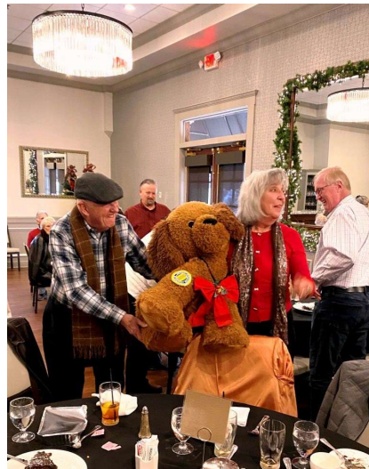
Proud Winners of the Surprise Gift!