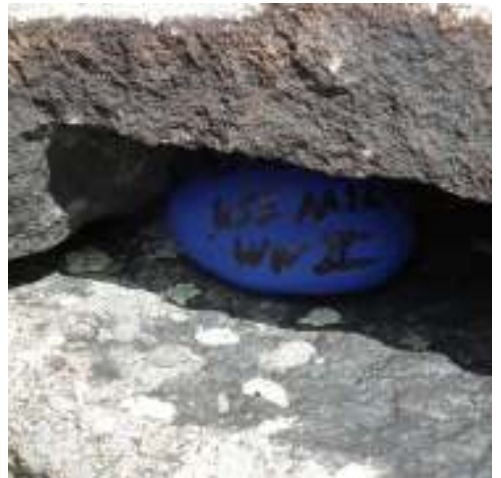
Messages left for the fallen on eternal stone.