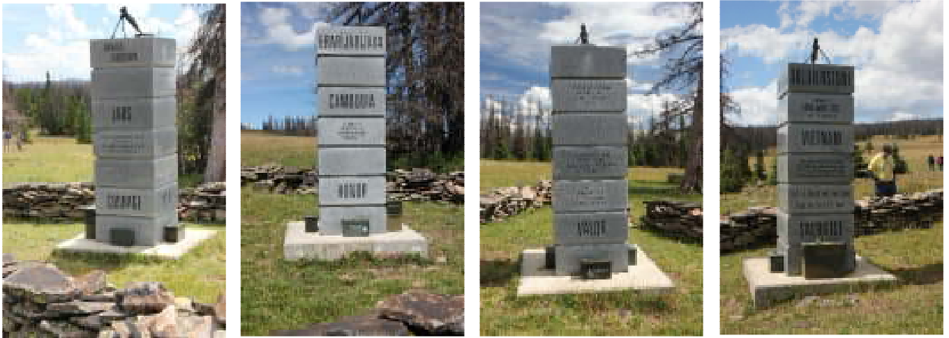
The sides of Soldier Stone

There are many engraved granite pieces in a circular pattern with inscriptions from each country represented and written in their home language. This stone brought instant tears to this writer.