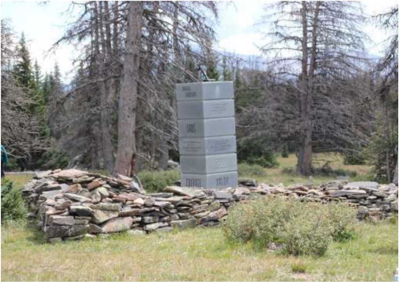
The remoteness of this place touches our heart as we served in the remote country of Vietnam!