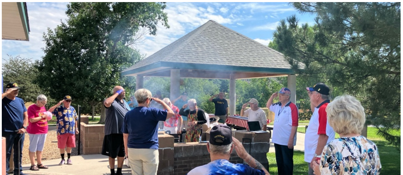
The picnic began with the National Anthem.