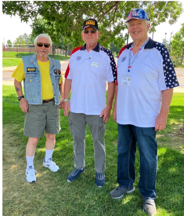
C O A S T G U A R D