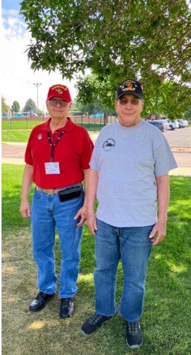
M A R I N E S

Continued from Page 2 – Veterans represented various branches of the military.